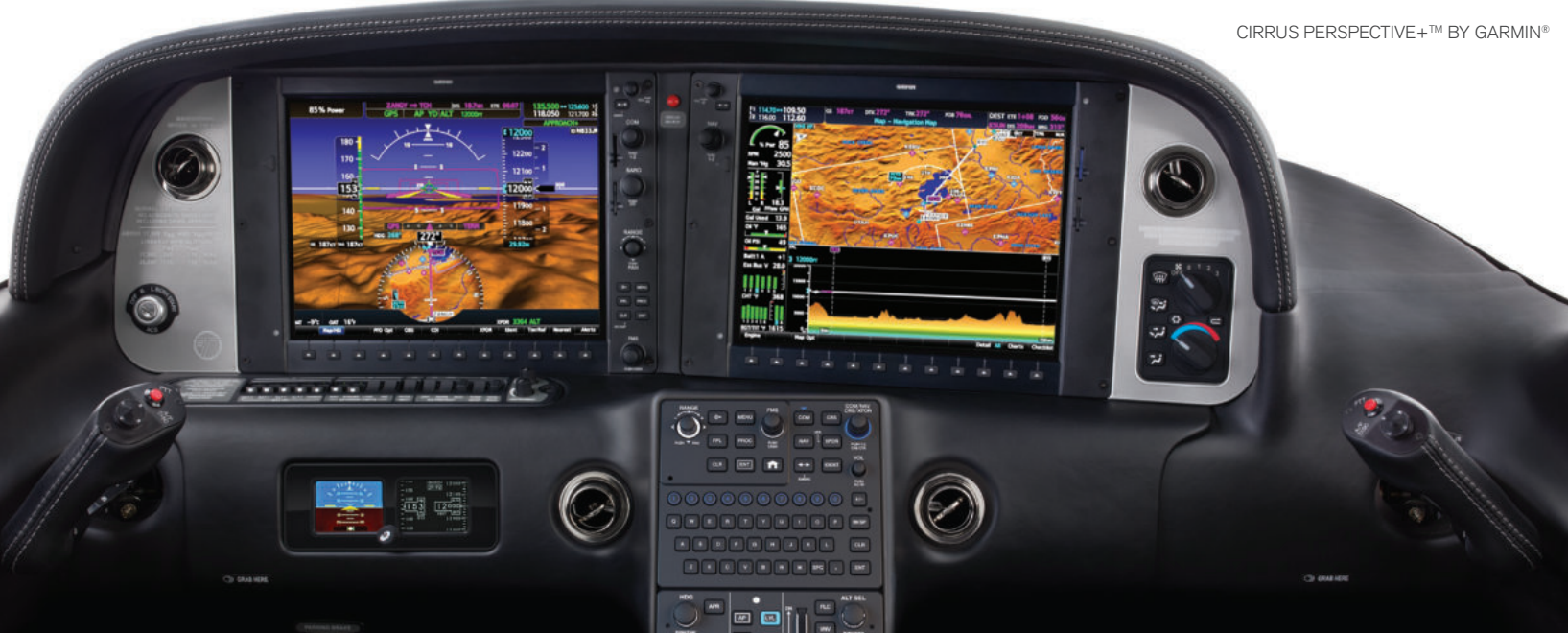
CIRRUS PERSPECTIVE+™ BY GARMIN®